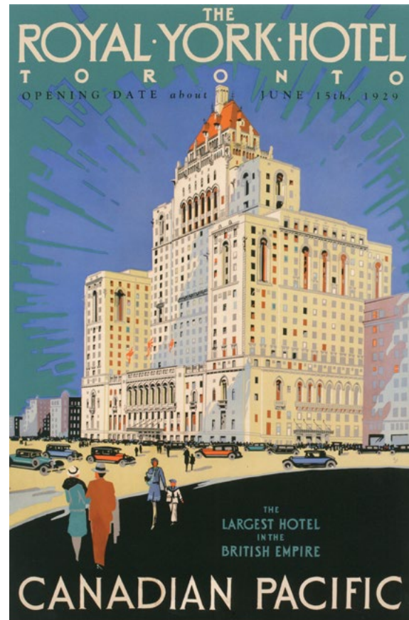
The Royal York Hotel, 1928, Canadian Pacific Railway poster