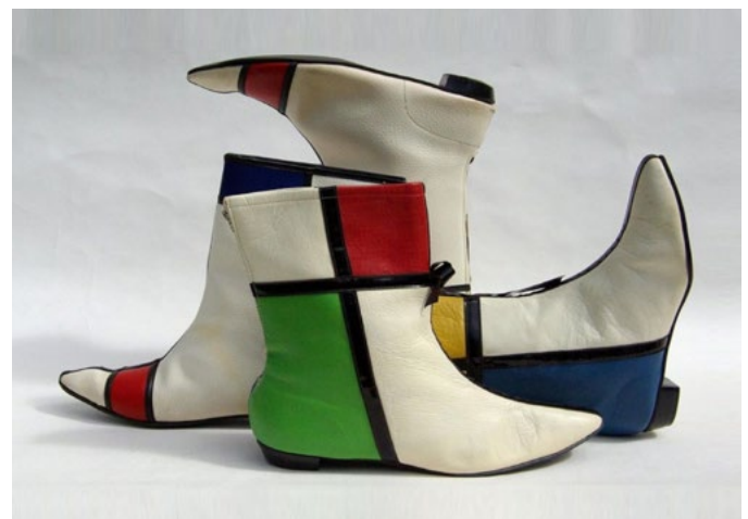
Two pairs of vinyl boots, founder's collection, Fashion History Museum c. 1965-66