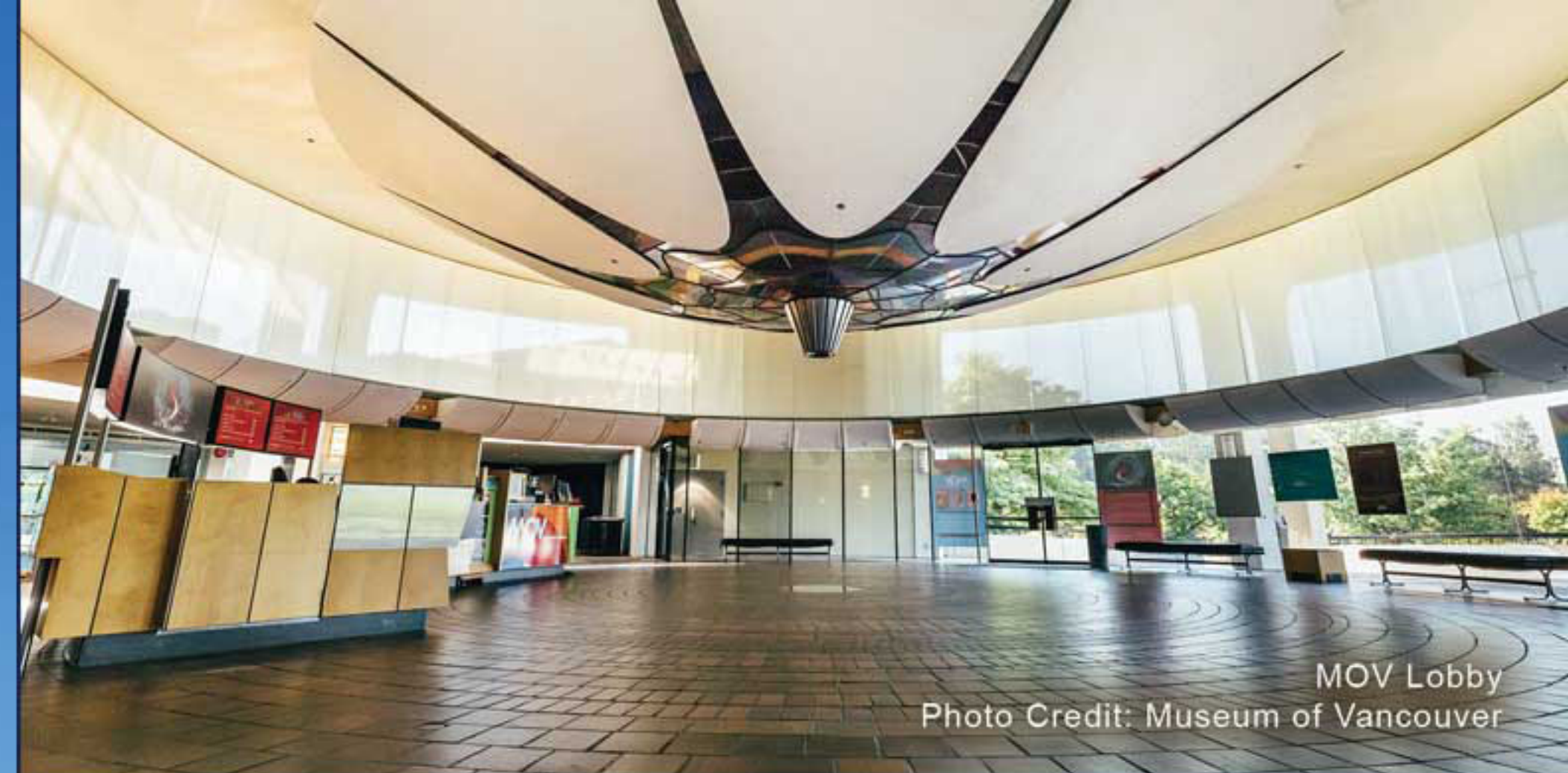
MOV Lobby