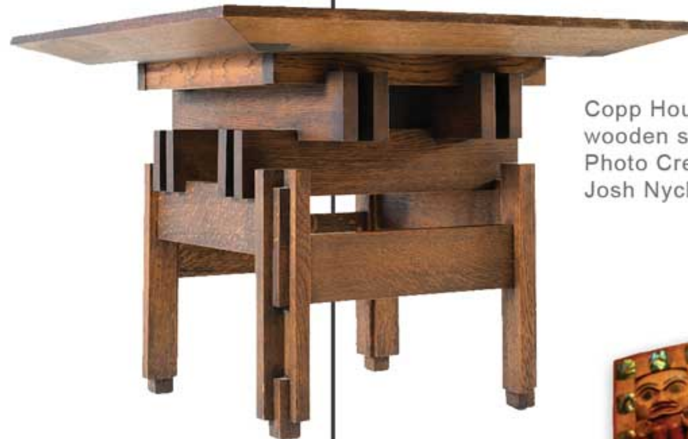
Copp House wooden side table

8:30am - 9:30am | Continental Breakfast at The Sylvia Hotel 9:45am - 10:45am | Exhibition Tour of Reclaim + Repair: The Mahogany Project at the Museum of Vancouver (MOV) 11:00am - 12:00pm | Ron Thom and the Art of Architecture with Adele Weder at Waddington's Vancouver (Railtown District)