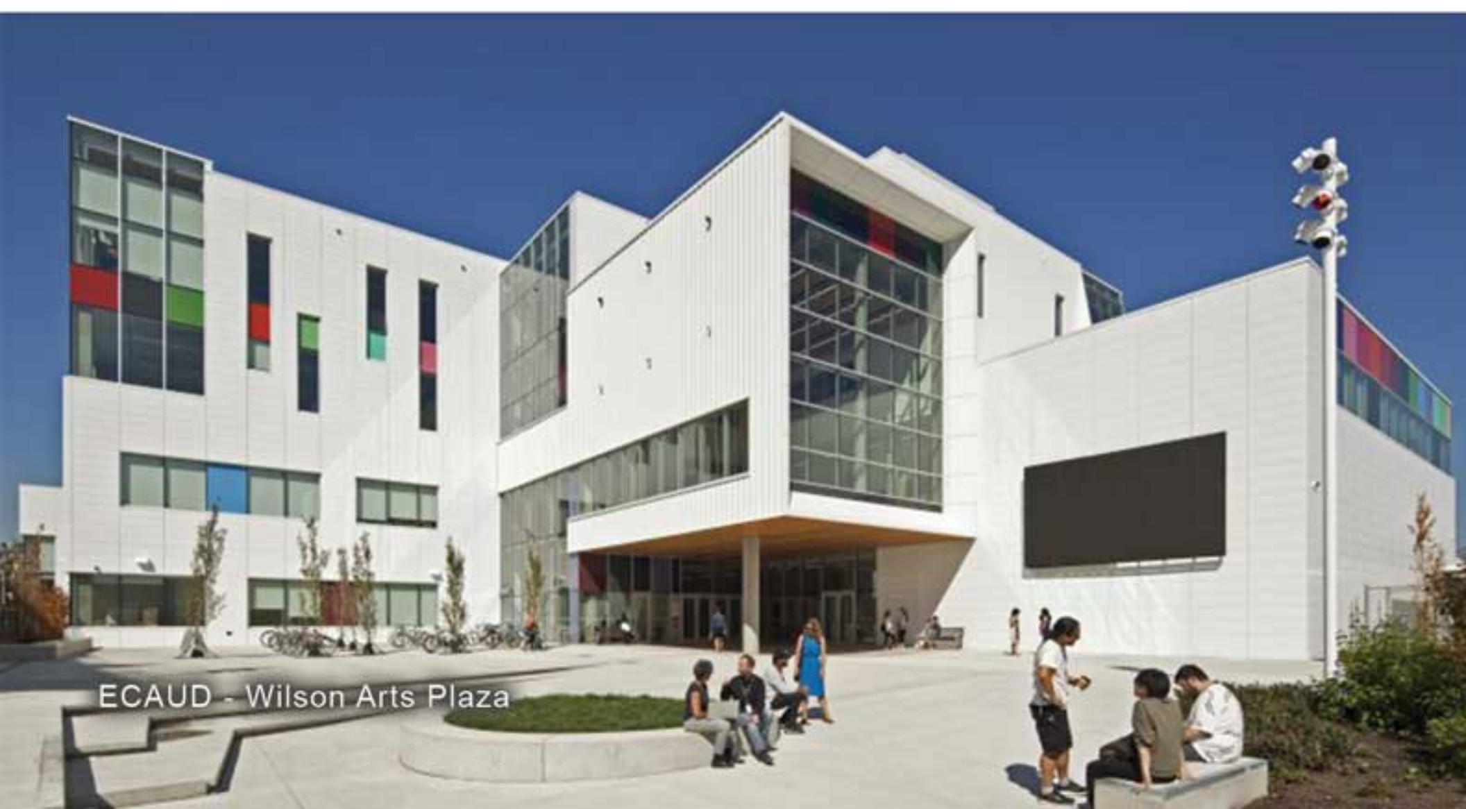
ECAUD - Wilson Arts Plaza