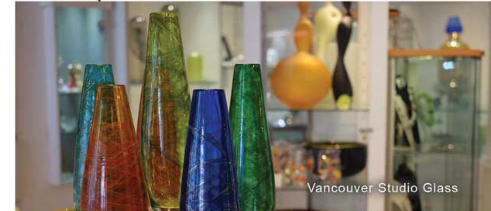
Vancouver Studio Glass

9:00am - 10:00am | Continental Breakfast at The Sylvia Hotel 10:00am - 10:20am | Walk along seawall to the Aquatic Centre and Granville Island Ferry 10:20am - 11:30am | Meet at Craft Council of British Columbia on Granville Island 11:30am - 1:30pm | Studio Tours