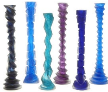
Brad Copping, Candlesticks

For online information and to view back issues of Ornamentum , visit www.ornamentum.ca